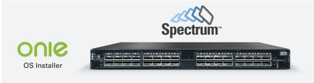
Figure 1. Open Ethernet Operating System and Hardware