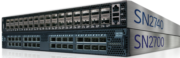
Front side view

The Mellanox SN2000 series come in three different configurations. All powered by the Spectrum™ ASIC, each configuration delivers high performance combined with feature-rich layer 2 and layer 3 forwarding, suited for both top-of-rack leaf and fixed configuration spines.